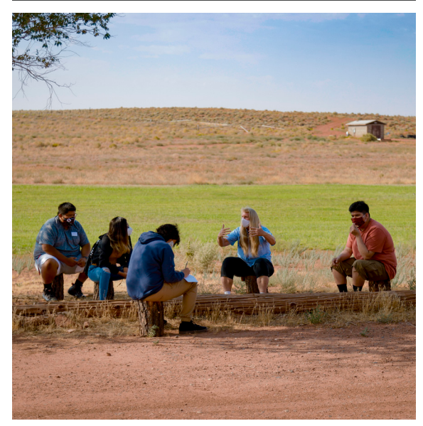
Continuing the Legacy